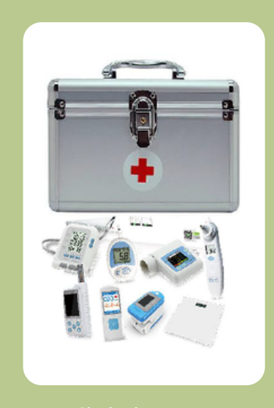
Clinic in a Box