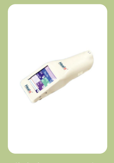
Clinic in Your Pocket